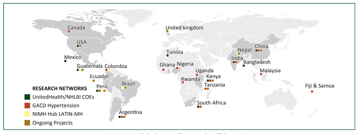
FIGURE 2. Global map of network collaborations.

GLOBAL HEART © 2015 World Heart Federation (Geneva). Published by Elsevier Ltd. All rights reserved. VOL. 10, NO. 1, 2015 ISSN 2211-8160/$36.00. http://dx.doi.org/10.1016/ i.gheart.2014.12.012