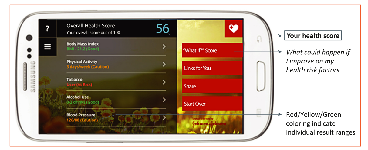
FIGURE 2. Scorecard app final results screen pictured on an Android phone.

All versions of the Digital Health Scorecard, regardless of platform, can upload data from each session to a central Microsoft Azure cloud-based database (except when data connectivity is absent, as previously noted). At no time is any personally-identifiable information captured and stored; however, the aggregated data does include basic demographic identifiers including age, gender, and zip/postal code (mobile apps will provide additional GPS data). As