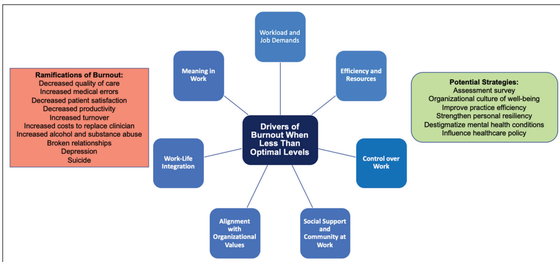
Figure 2: The Personal and Professional Ramifications and Drivers of Burnout and Potential Strategies to Address Clinician Well-Being. The personal and professional ramifications of burnout (left), drivers of burnout (center circle) when less than optimal levels, and potential strategies to address clinician well-being (right).

ramifications of clinician burnout include higher rates of medical errors, lower quality of care, decreased patient satisfaction, increased disruptive behavior, and loss of professionalism accompanied by a decreased level of empathy [3, 5, 11–14]. Health system expenditures related to the burnout of staff are steep when taking into account institutional costs due to decreased productivity and increased clinician turnover [15–18]. In the past year, the coronavirus disease 2019 pandemic has caused additional strain on clinicians through increased patient mortality, personal and family safety concerns, fear of the unknown, and increased work demands. Although clinician well-being is now openly discussed in the media, the stigma of seeking mental health counseling among clinicians remains.